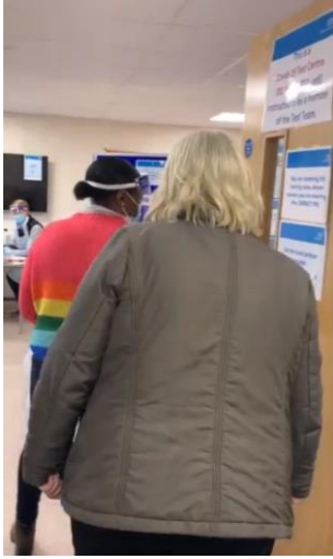
The test room