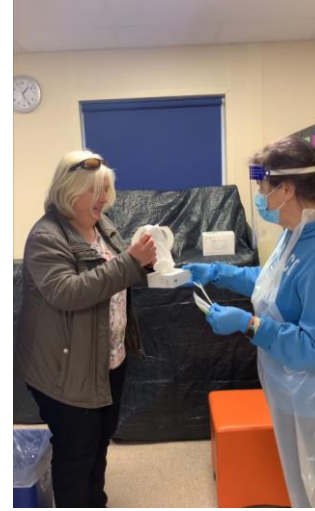
Take a tissue!