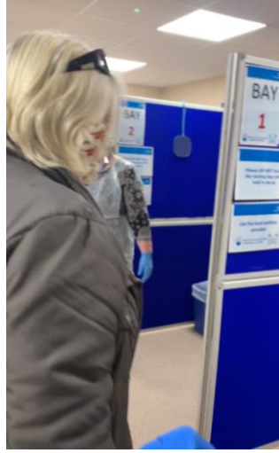
The test bays