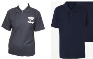
Navy Plain / Embroidered PE Polo Shirt