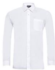
Boys Plain White Long / Short Sleeve Shirt