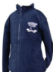
Navy Embroidered PE Fleece