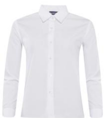
Girls Plain White Long / Short Sleeve Blouse