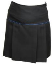
Preferred Girls Skirt