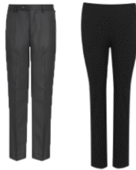
Smart Black Trousers