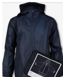
Navy PE Raincoat