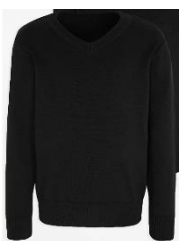
Boys Plain Black Jumper