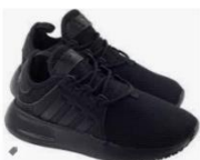
PE Trainers (No High Tops)