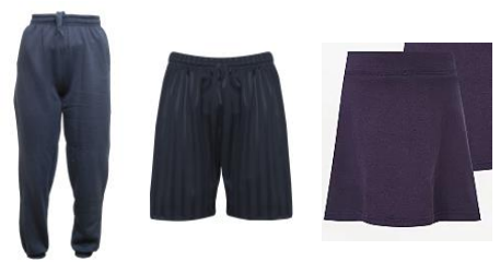
Navy Plain PE Jogging Bottoms, shorts / Skort (Girls)