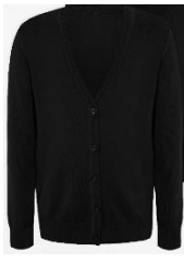
Girls Plain Black Cardigan