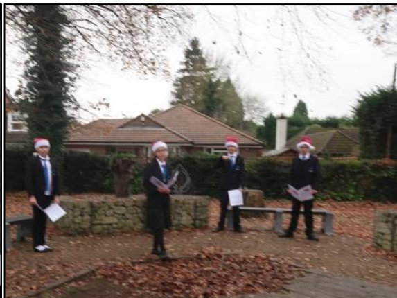
Year 8 imagining Christmas during the war